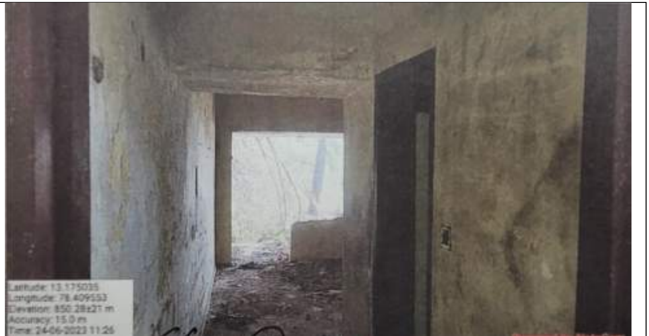
Exterior Area of the Property